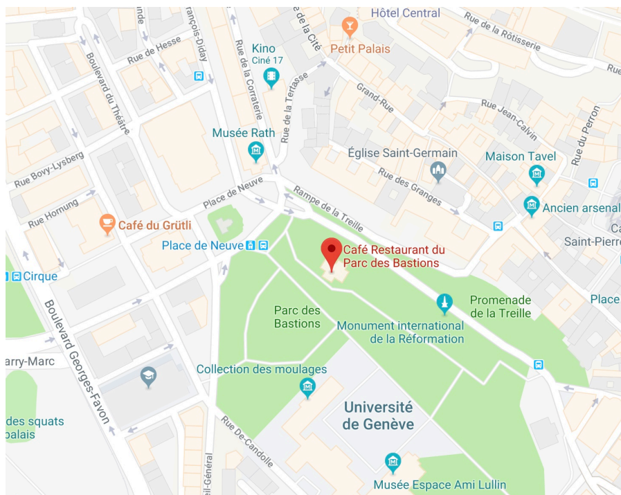
Map: Café restaurant du Parc des Bastions