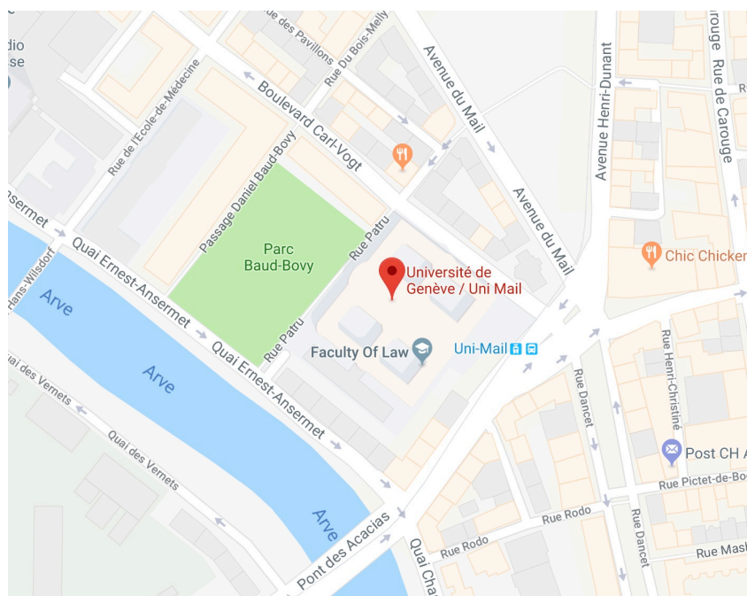
Map: Uni Mail